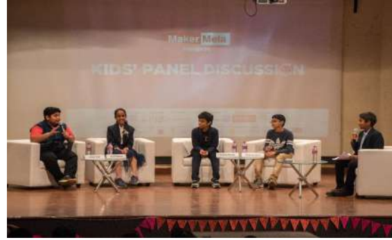
Kids' Panel Discussion