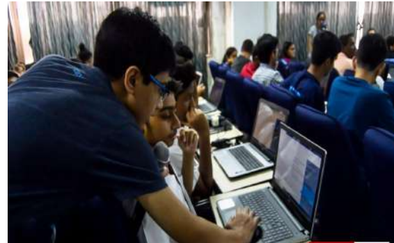
Tanmay Bakshi: IBM Watson workshop