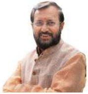
Shri. Prakash Javadekar Hon. Union HRD Minister