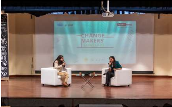
Fireside chat with MostlySane