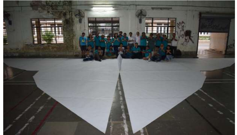
Largest Origami Butterfly