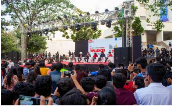
Asia's Largest Influencer Gathering