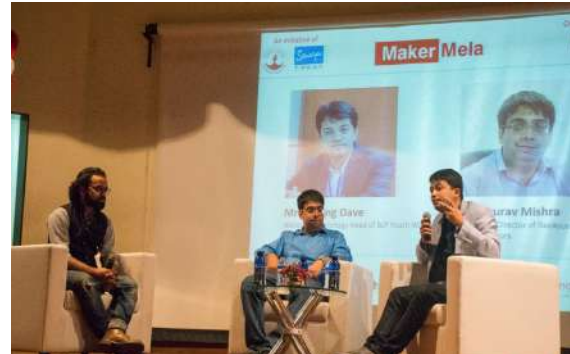
Inspired by Makers