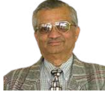
Dr. Anil Kakodkar Former Chairman, Atomic Energy Commission of India & Secretary, GOI