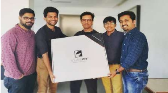
Square off - Consumer Electronics Show Las Vegas (Coolest invention of 2017-18 by digital trends). Raised over $2mn in total investments