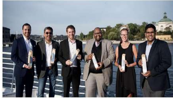
Indra water - Global Urban Water challenge 2019 & $20,000 cash.