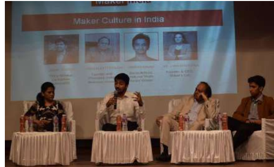
Panel discussion on Maker Culture in India