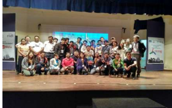
FAN3 - Networking with International Makers