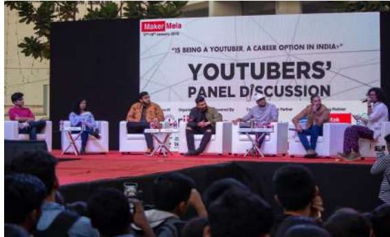
YouTubers' Panel Discussion