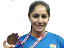
Ms. Manasi Joshi Bronze Medalist at Para Badminton, Intl.