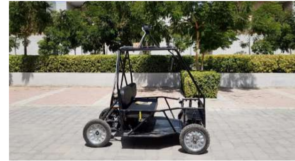
Accelo - Recognized as the Top Startup in Artificial Intelligence in Mumbai.