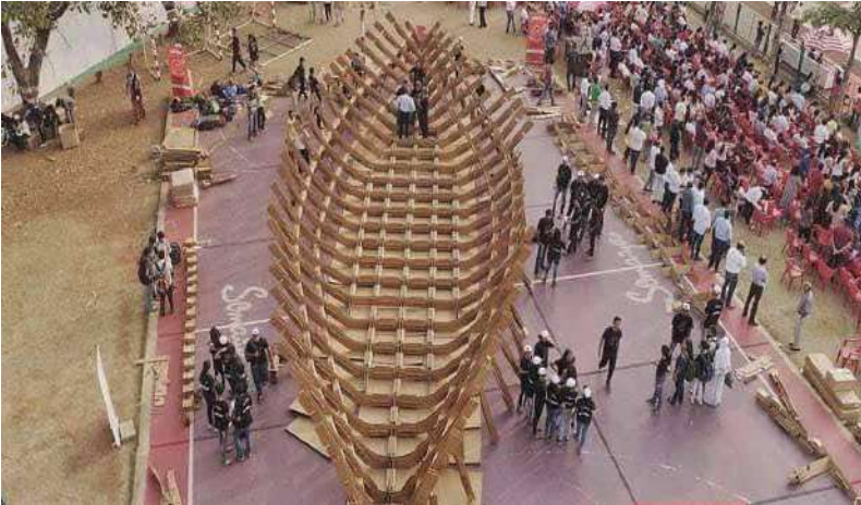
Largest Cardboard Sculpture