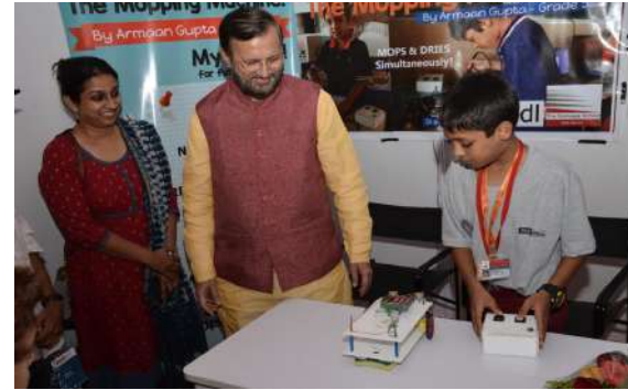
Interaction with Dignitaries