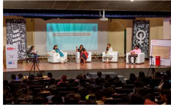
Breaking Barrier: A Panel Discussion