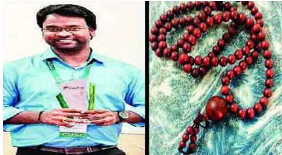
JioVio - 2019 Gifted Citizen award Mexico, (CDI) City if Idea event