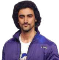
Mr. Kunal Kapoor Actor & Co-Founder, Ketto