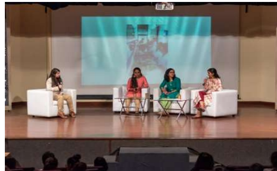
Talk Show with #PaanSePareshaan girls