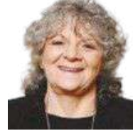
Prof. Ada Yonath Nobel Prize Laureate